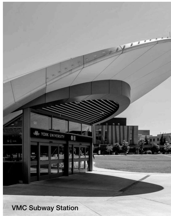
VMC Subway Station